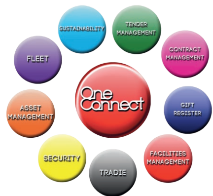
One Connect Software Modules

One call One provider One invoice One solution